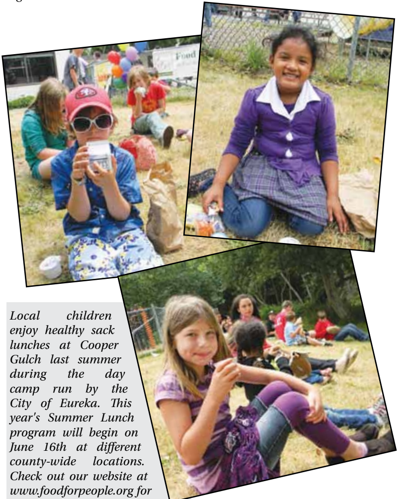
Local children enjoy healthy sack lunches at Cooper Gulch last summer during the day camp run by the City of Eureka. This year's Summer Lunch program will begin on June 16th at different county-wide locations. Check out our website at www.foodforpeople.org for updated information.

of nutritious and appealing foods. It is a harsh reality in Humboldt County that more than 50% of school-aged children may not be getting the food they need during the summer months, and they may be fending for themselves during a large part of the day. The Children's Summer Lunch program offers free, healthy sack lunches to all children aged 18 and under at participating sites. Many of the sites we partner with are parks and recreation programs, Boys & Girls Clubs, or community centers,