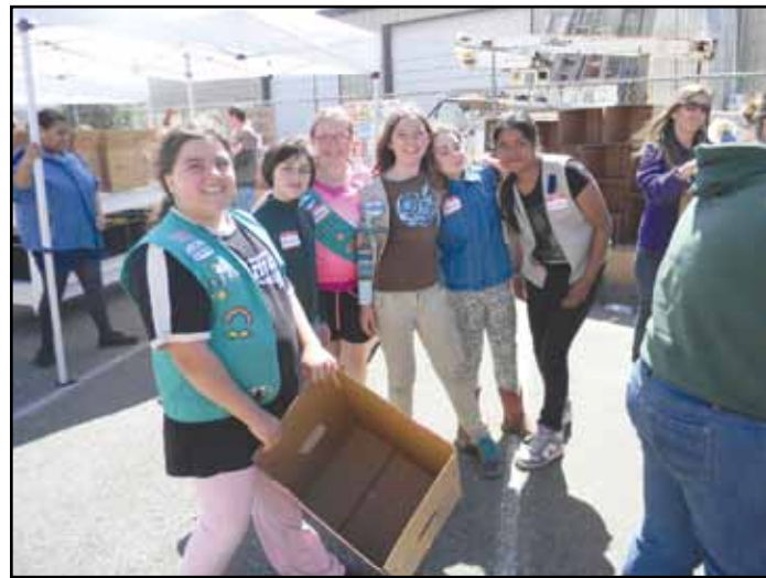
Everyone gets put to work during the Letter Carriers Food Drive, even Congressman Huffman (above photo). Local Girl Scouts also showed up to help unload and sort food (bottom photo). Letter Carriers, Food for People representatives and elected and campaigning officials helped kick-off this year's Letter Carriers' Food Drive at the Eureka Post Office (at right).