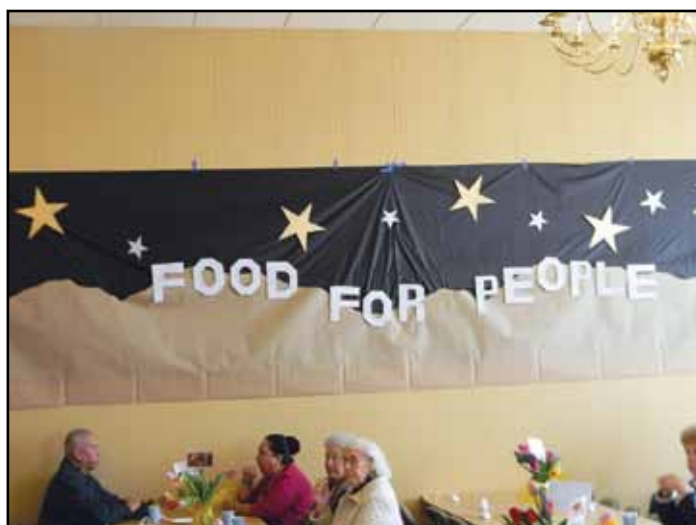
Photos show several volunteers posing for the photo booth with the help of various wigs and props; Volunteers from throughout the county take time to enjoy the evening; Hollywood-like banner sets the stage for our stars!