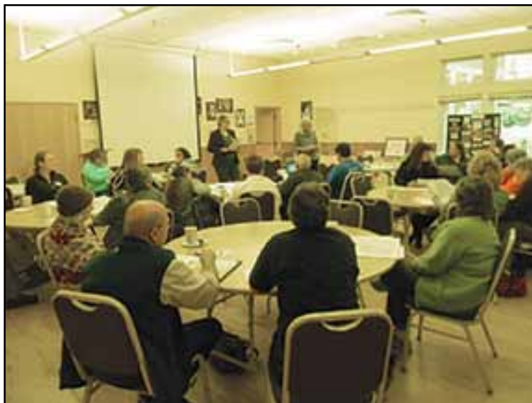
Representatives from pantries throughout the county came together for a day of networking, sharing and learning at Humboldt Area Foundation.