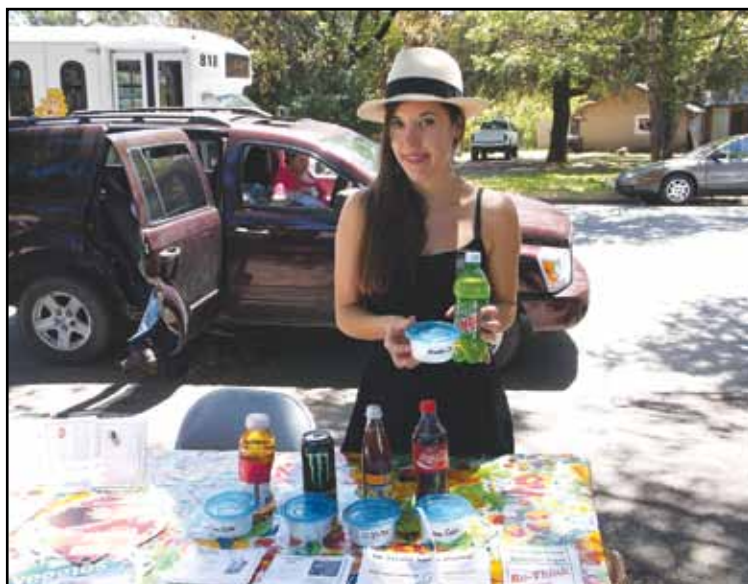
Ciel displays "Rethink your Drink," which helps people to understand the amount of sugar in popular drinks. She also provides infused water at her display to show people a healthy and easy alternative this summer!