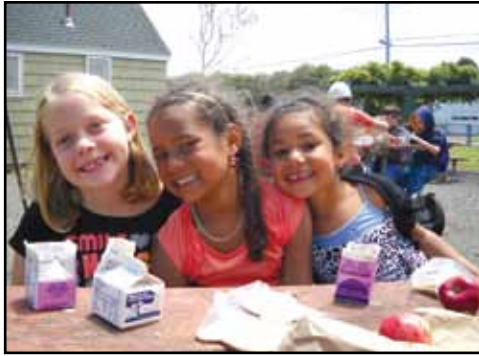
Lunch and fun at Carson Park in Eureka thanks to our Children's Summer Lunch Program.

adults under the age of 60 who are coping with temporary or permanent illness or disability, or recovery from surgery or medical treatments.