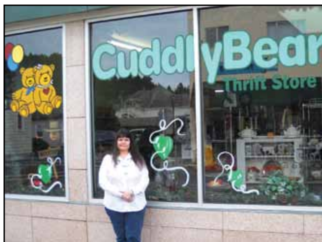
Cuddly Bear Thrift Store