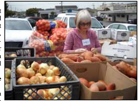
Fresh produce is available at our Free Farmers' Market-Style distributions at four locations.

The 2012 season of our monthly free farmers' market-style produce distributions provided more than 151,000 lbs of fresh food at four locations May through October. Combined, the sites served an average of 555 households per month, which represents more than 1,700 children, seniors and other individuals on average within those households. Sites include Garberville, Redway, Fortuna and Eureka's Food for People, at which we feature live music, recipe giveaways,