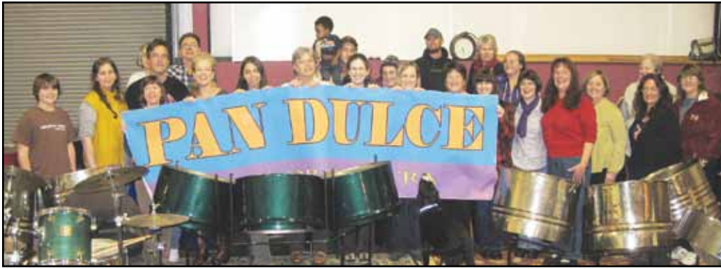
Pan Dulce Steel Orchestra