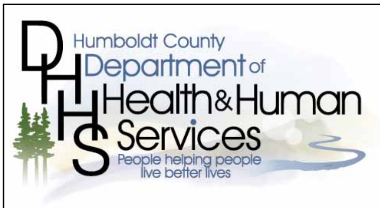
Social Services Branch

Each team collected more than 500 pounds/dollars this Holiday Season!