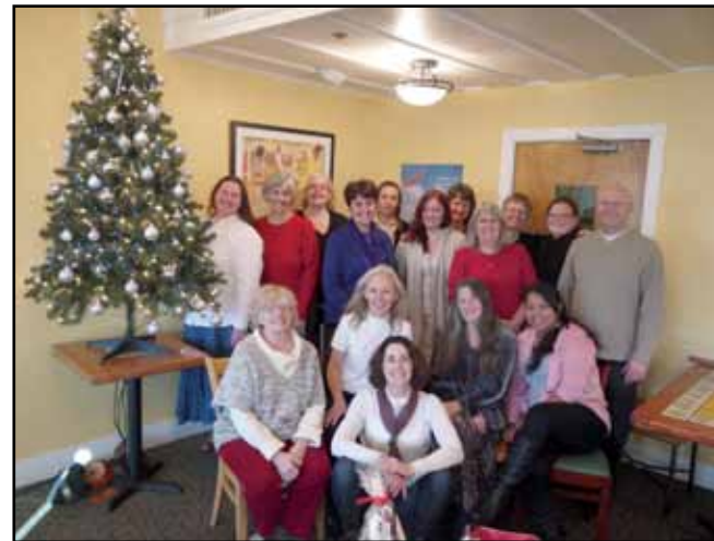
Area One Agency on Aging