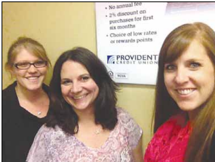
Provident Credit Union