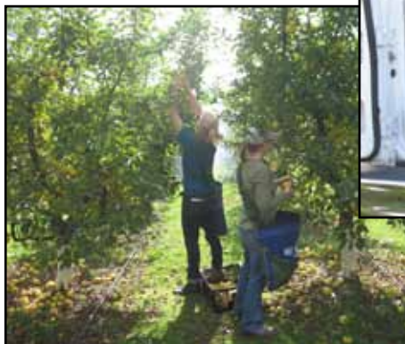
In 2012, our Gleaning Program brought in close to 43,000 lbs of fresh, local produce!

The Homebound Delivery program provided an average of 100 bags per month to homebound