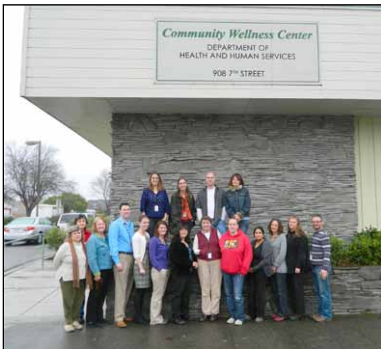
Community Wellness Center