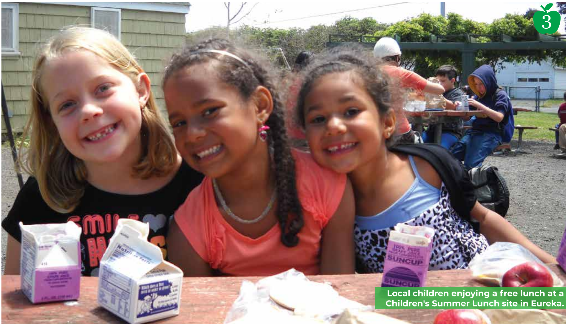
Local children enjoying a free lunch at a Children's Summer Lunch site in Eureka.