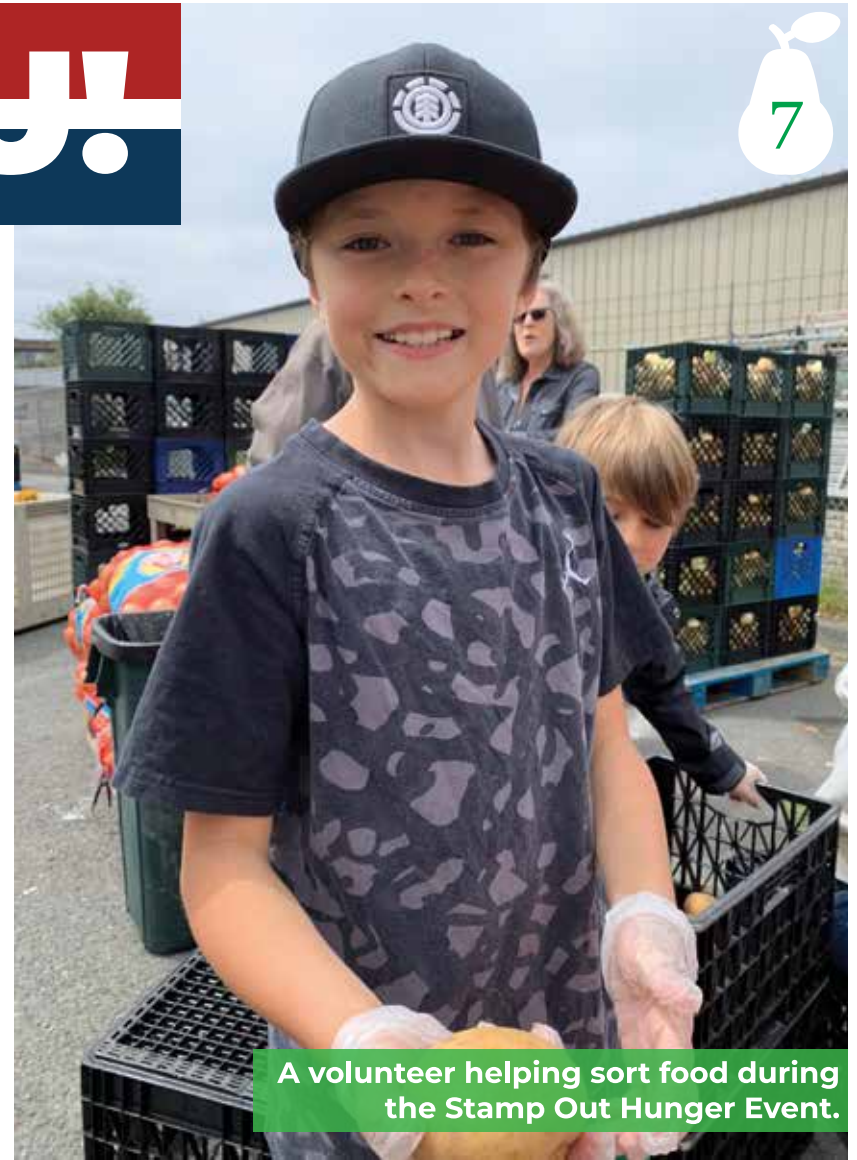
A volunteer helping sort food during the Stamp Out Hunger Event.

This effort by the National Association of Letter Carriers (NALC), with the help of rural carriers, other postal employees and numerous other volunteers, has resulted in the delivery of well over one million pounds of food in Humboldt since its inception more than twenty years ago. In Humboldt County, the food collected is used to supplement food boxes for low-income families and seniors. Food for People and its network of 17 pantries serve more than 12,000 Humboldt County children, seniors, and other individuals each month. All food collected stays in the community in which it was donated to help local individuals and families in need.