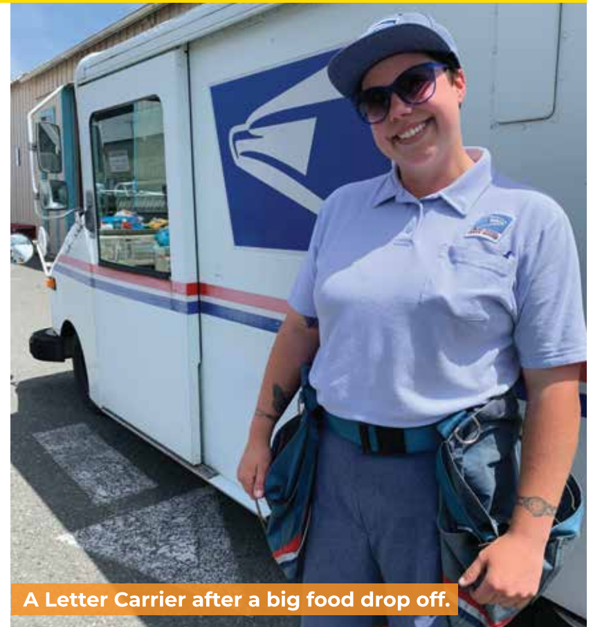
A Letter Carrier after a big food drop off.