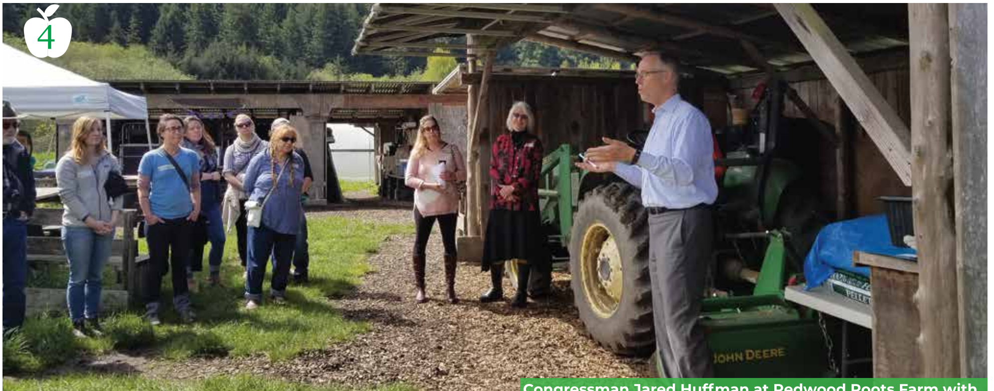
Congressman Jared Huffman at Redwood Roots Farm with Food for People and the organizers of Locally Delicious