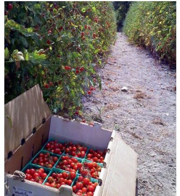
Hard at work gleaning cherry tomatoes in Willow Creek.