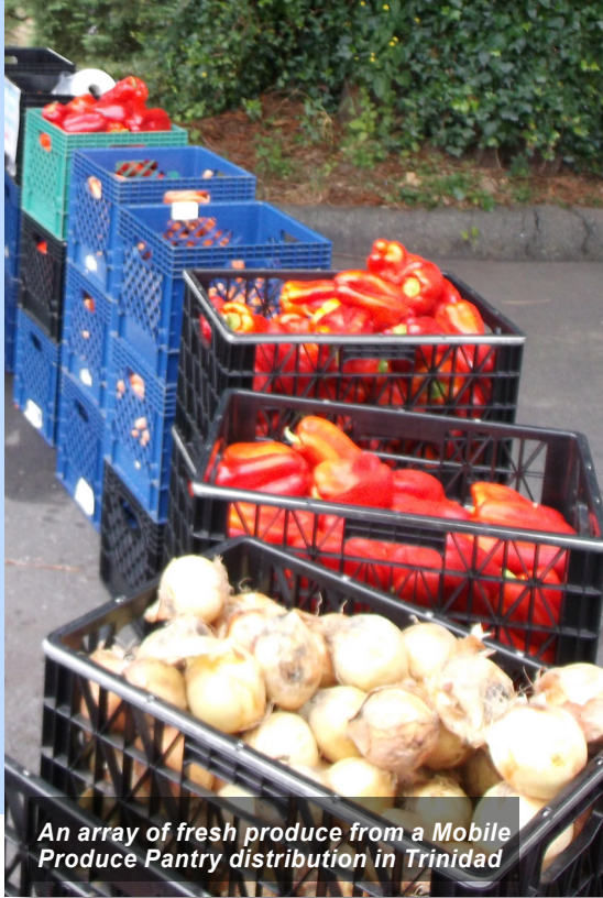
An array of fresh produce from a Mobile Produce Pantry distribution in Trinidad