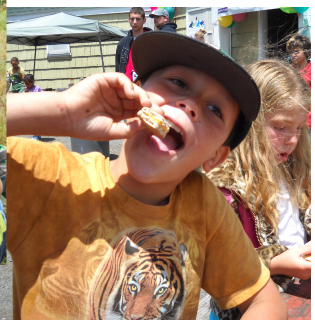
Local youth were all smiles while they enjoyed lunches from the Children's Summer Lunch Program. Food for People and our local community partners work together to pack and distribute hundreds of lunches for children every weekday during the summer months.