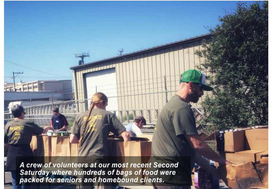
A crew of volunteers at our most recent Second Saturday where hundreds of bags of food were packed for seniors and homebound clients.