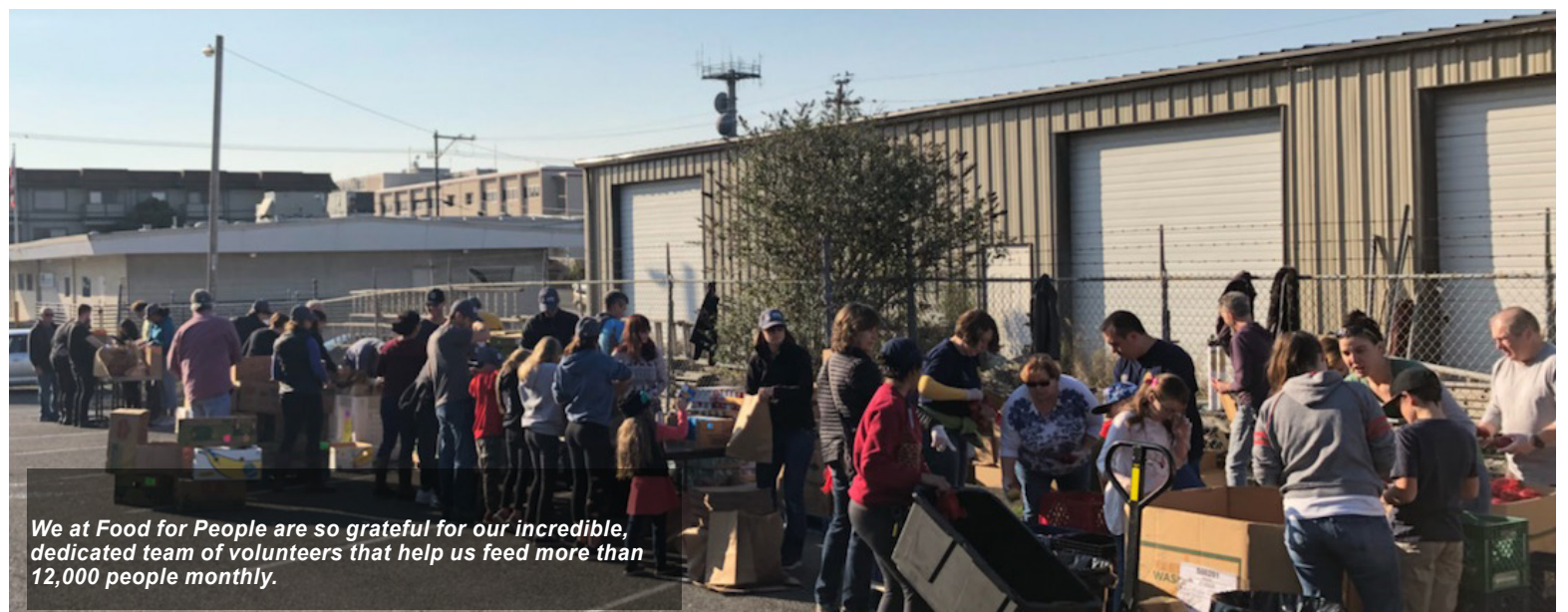
We at Food for People are so grateful for our incredible, dedicated team of volunteers that help us feed more than 12,000 people monthly.