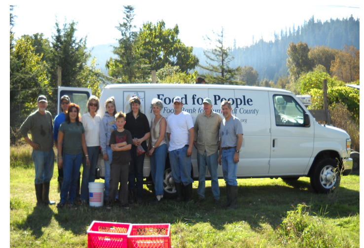
Volunteers from Rotary gleaning produce at a local farm.