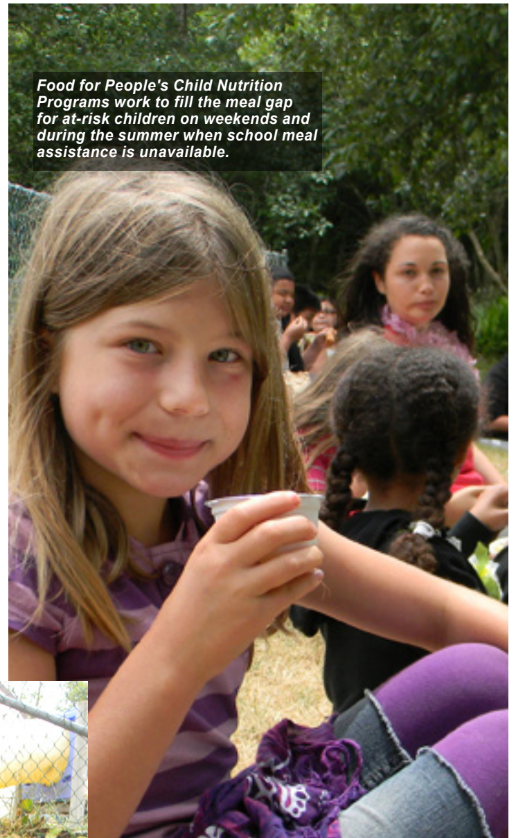
Food for People's Child Nutrition Programs work to fill the meal gap for at-risk children on weekends and during the summer when school meal assistance is unavailable.