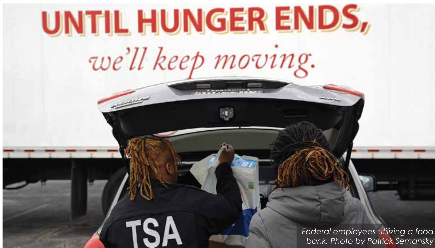
Federal employees utilizing a food bank.

I'm hoping that by the time you read this the government shutdown will have ended and hundreds of thousands of government workers, some of whom have continued to work and others who have been shut out of their offices, will have received their paychecks and back pay. Our hearts go out to all those who are dealing with the enormous stress of not knowing how they are going to pay their rent or mortgage, put gas in the car (or make a car payment), cover medical and/or childcare costs and put food on the table. And in addition to the immediate impacts, we know all too well that there are ripple effects