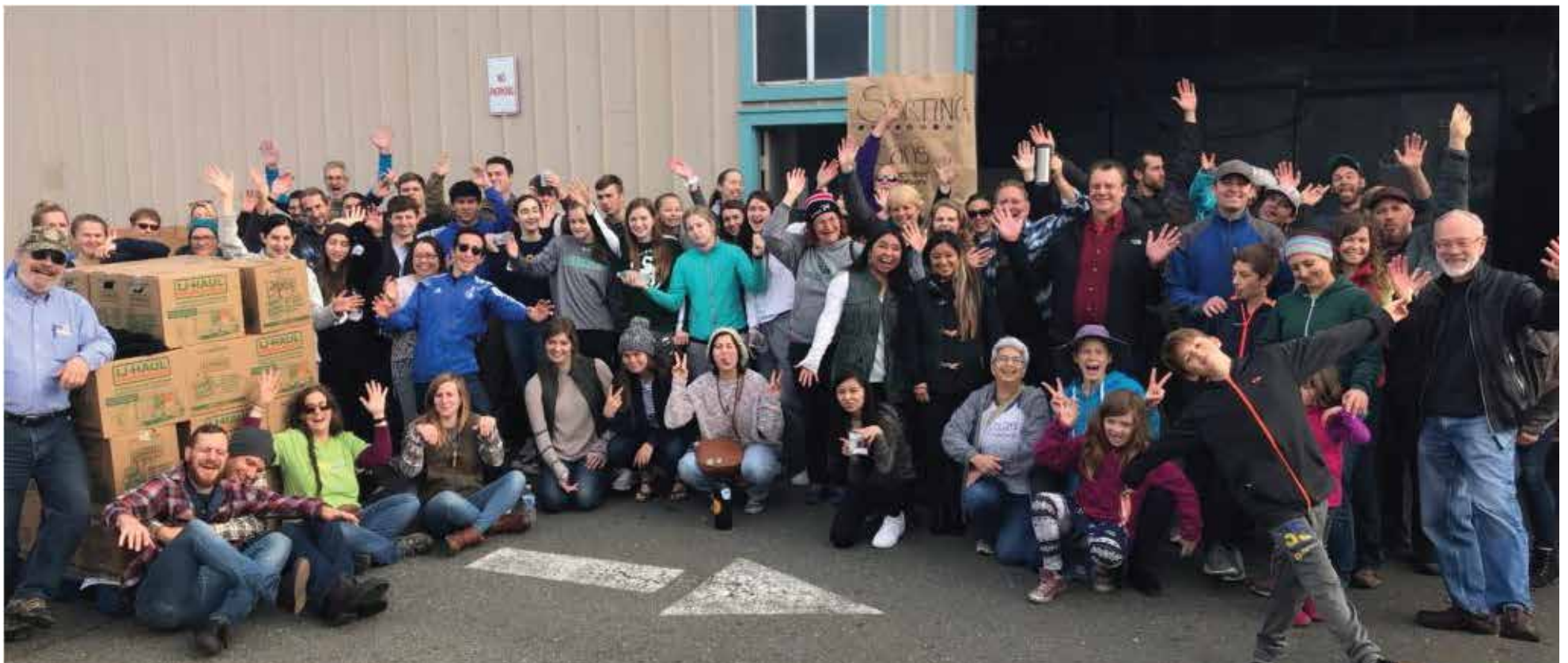
Food for People volunteers & staff at the McGuire Food Drive sorting event

Food for People The Food Bank for Humboldt County