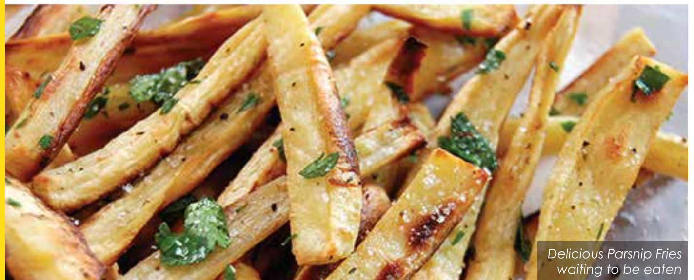
Delicious Parsnip Fries waiting to be eaten

T he next time you're in the grocery store or choice pantry keep an eye out for parsnips. This odd shaped relative of the carrot can be added to roasted vegetables, soups, and mashed vegetables. Parsnips are packed with vitamin C, folate, manganese, and fiber and add more flavor and complexity to dishes than potatoes and carrots alone. Pick up some parsnips and try this parsnip fry recipe.