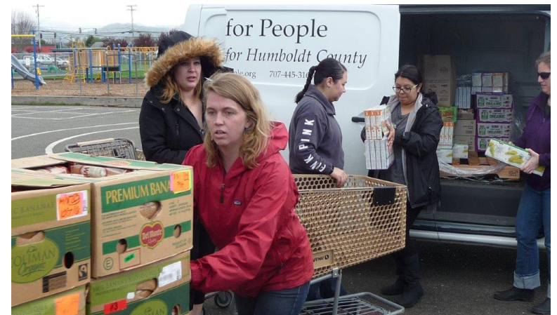
Fortuna Family Resource Center Staff unload a Backpacks for Kids delivery.

Teachers tell me that they can tell once a child starts receiving the food for the weekends. They might