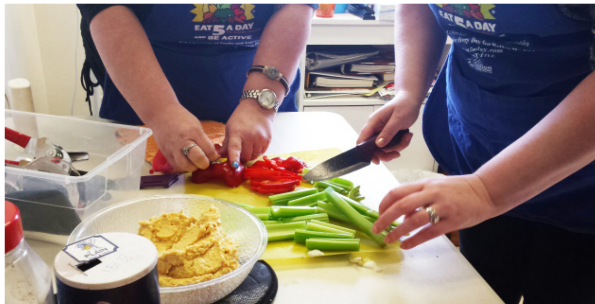
Students chop vegetables during a Food for People cooking class.

As Food for People’s CalFresh Nutrition Education Coordinator, I teach a children’s cooking and nutrition class at the Jefferson Community Center once a month for their afterschool SEEDS program. Ages range from age six to ten, and I have been able to apply these wider conceptualizations of taste there. Even if children believe they will not like eating a certain dish, they are almost always enthusiastic about preparing it. I make sure the experience is as hands-on as possible. It’s fun to measure, to get a little dusty from flour; to get sticky from mixing oats and fruit and honey; for the oldest children to help the littlest ones push up their sleeves; to make a random assortment of ingredients blend into a delicious concoction. Then, usually, even the kids who swore they would never try it, sneak a nibble. “You absolutely never ever have to like it. That’s not a requirement for this activity.” I tell them. “But try it and see if you can describe what it is