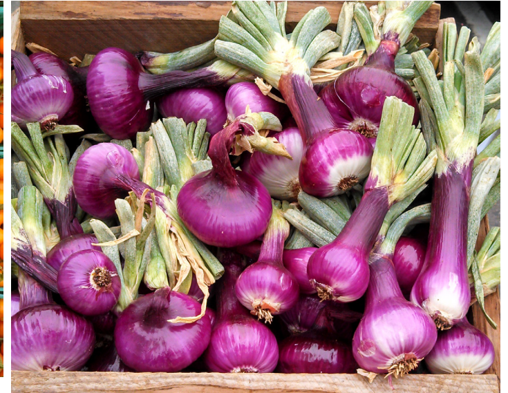
Fresh produce from local farms is purchased for Food for People's programs through the Locally Delicious Food Fund.

As we approach the warm season here in Humboldt County, the fruit trees are relentlessly blooming, reminding us of the summer to come. Thoughts of ripening peaches, bursting heirloom tomatoes, and the crisp cool crunch of lemon cucumbers come to mind.