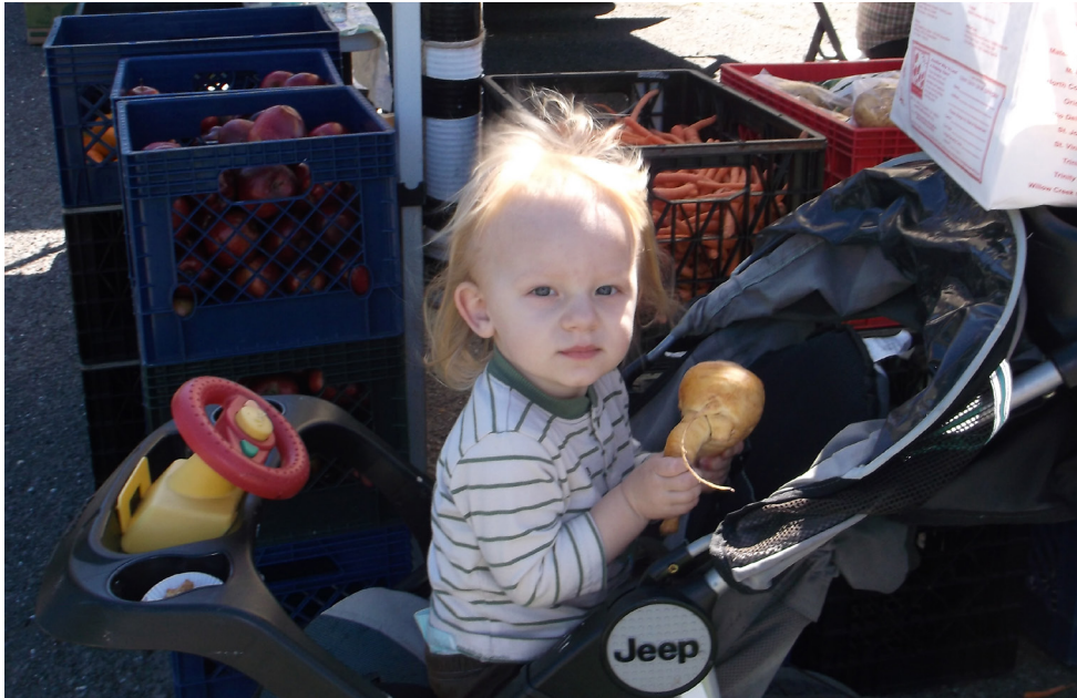
Clients of all ages enjoy a wide variety of fresh fruits and vegetables provided by the Mobile Produce Pantry in rural and remote communities throughout Humboldt County.