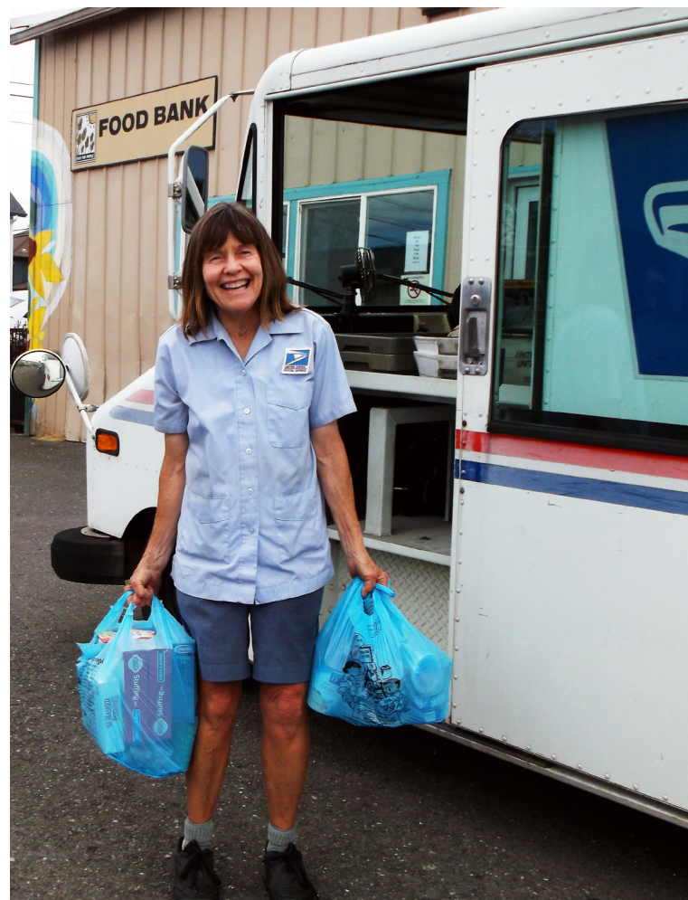
Continued on page 4 A local letter carrier delivers bags of food donations to Food for People.

relief for low-income residents during the summer months, when school children are without the meal assistance provided during the school year and struggling families are in need of help. For the fifth year in a row, we used blue, pre-printed donation bags in our outreach efforts, and worked with letter carriers to have them distributed to mailboxes throughout the county during the week leading up to the drive, to make it easier for folks to donate.