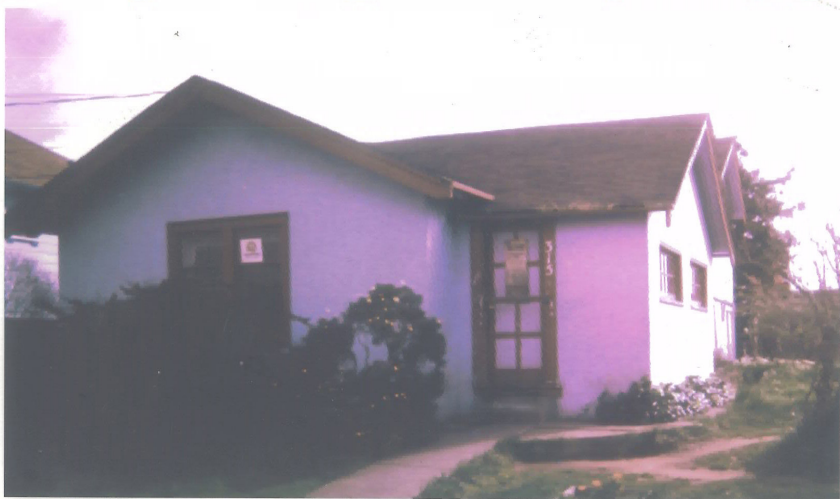
The street view of the facility on V Street which we occupied for almost 20 years.

At the same time, we are seeing unprecedented growth in the need for our services — a common thread among all of our programs, as you will read in this newsletter. At a time of such pivotal change, we took a moment to reflect on where we are as an organization and where we came from. We recently completed a staff retreat, taking note of what we are doing well and what challenges we still have to overcome. At the same time, we centered ourselves in the history of this organization that has been serving the community and fighting for solutions to poverty and the root causes of hunger for 44 years.