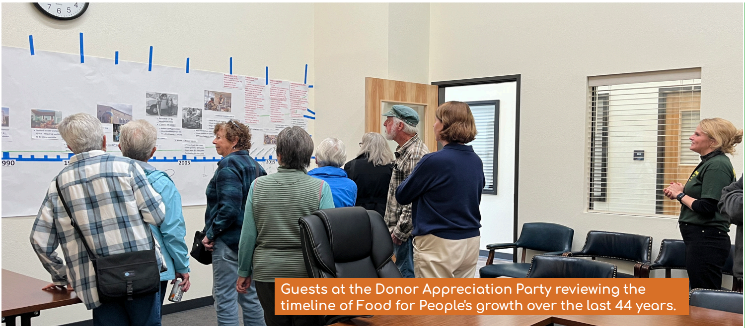
Guests at the Donor Appreciation Party reviewing the timeline of Food for People's growth over the last 44 years.

While celebrating what is going well at Food for People, it is also important to acknowledge the challenges we are facing. The overwhelming concern among all of our staff is how many more people are seeking our assistance than just six months ago. Last month was a record for Food for People, with the most people served in our 44-year history (not an encouraging record to set at a food bank). This dramatic change is happening as societal and economic shifts drive up the costs of food and other daily essentials, impacting more and more families at the same time that multiple assistance programs' benefit levels (CalFresh, Pandemic EBT, etc.) are decreasing or ceasing. It is difficult to see the growing need in our community and hear the accompanying stories from our friends and neighbors without feeling the weight of it in our hearts. With the new building, and a strong pool of food funding, we have been able to grow to meet this need, but it is a worrying trend that we hope does not continue.