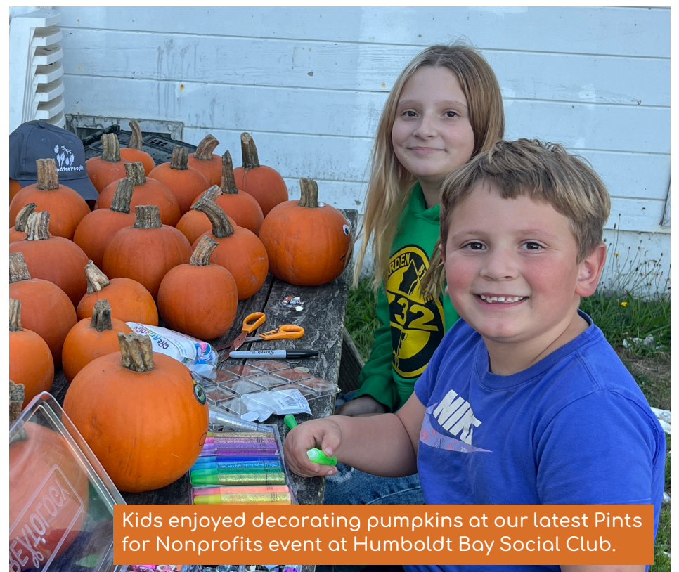
Kids enjoyed decorating pumpkins at our latest Pints for Nonprofits event at Humboldt Bay Social Club.