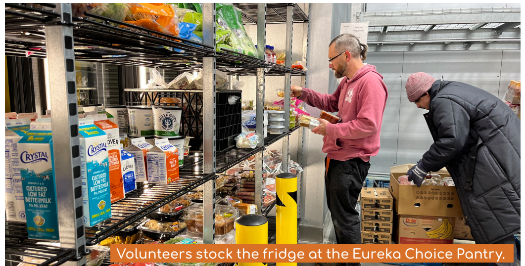
Volunteers stock the fridge at the Eureka Choice Pantry.