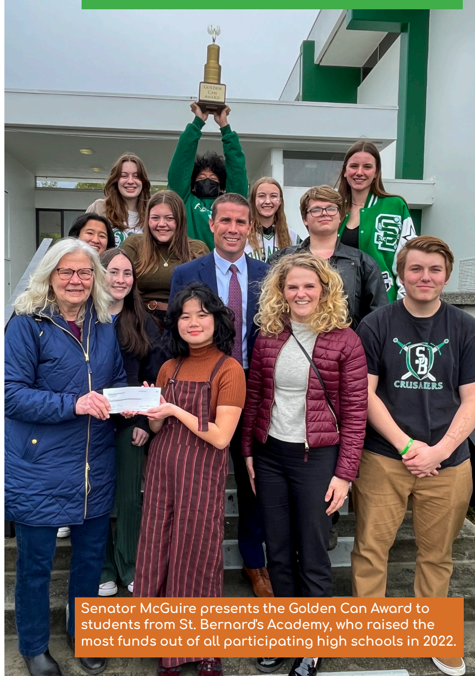
Senator McGuire presents the Golden Can Award to students from St. Bernard's Academy, who raised the most funds out of all participating high schools in 2022.