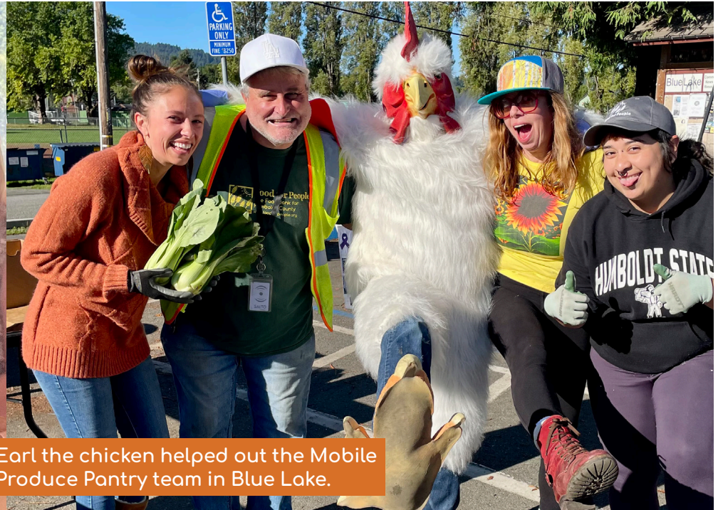
Earl the chicken helped out the Mobile Produce Pantry team in Blue Lake.

Food for People received another boost to our efforts serving the most rural areas of the county with a second grant from the USDA Reach and Resiliency program. During the first round of this grant, we relied on partnerships with community organizations and tribal agencies to assess needs and develop monthly food distributions in areas we were not previously serving. Working with community and family resource centers has been a great way to tap into small towns. The staff at these organizations typically live and work in the communities they serve and can represent the lived experiences in these areas. Each resource center represents a unique community with localized needs, and we recognize them as experts in their areas. At our Pantry Summit this year, Emily Herman, Executive Director of the Mattole Valley Resource Center, illustrated this point, "If you've seen one resource center, then you've seen one resource center" explaining that no two resource centers are alike.