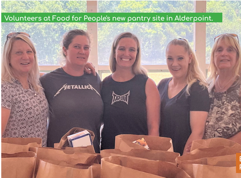
Volunteers at Food for People's new pantry site in Alderpoint.