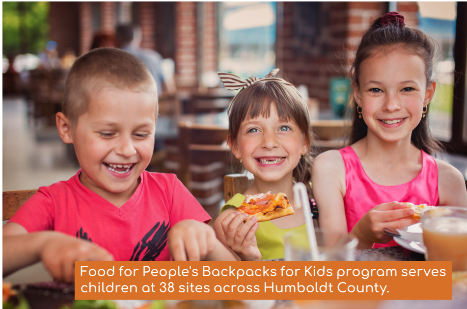
Food for People's Backpacks for Kids program serves children at 38 sites across Humboldt County.