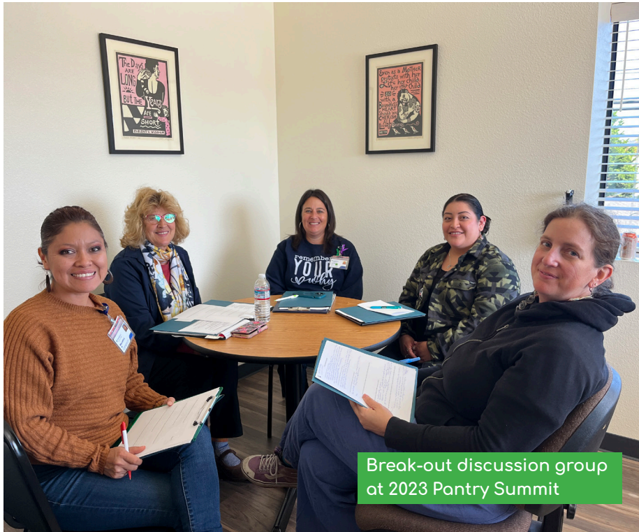
Break-out discussion group at 2023 Pantry Summit