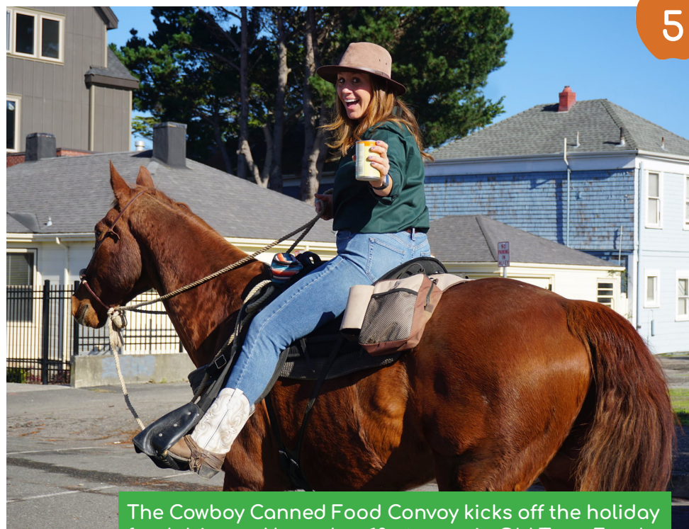
The Cowboy Canned Food Convoy kicks off the holiday food drive on November 18 at noon in Old Town Eureka.