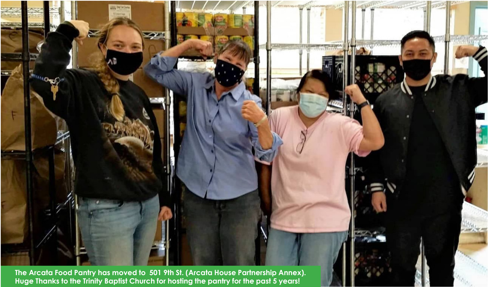
The Arcata Food Pantry has moved to 501 9th St. (Arcata House Partnership Annex). Huge Thanks to the Trinity Baptist Church for hosting the pantry for the past 5 years!