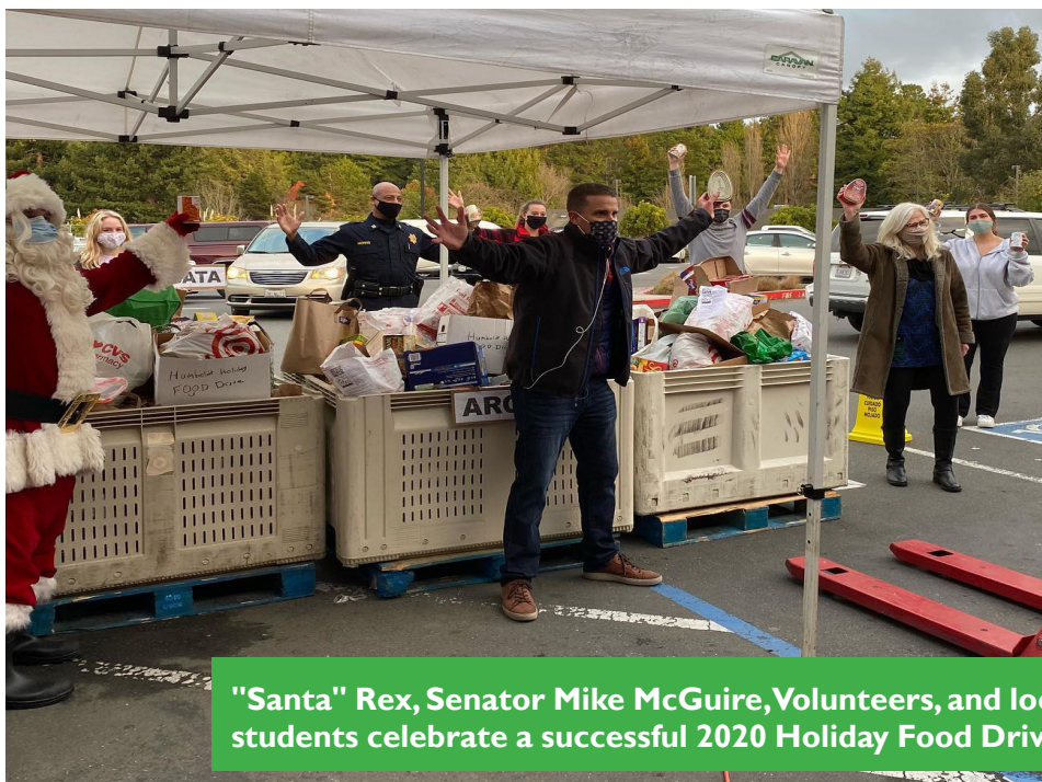
"Santa" Rex, Senator Mike McGuire, Volunteers, and local students celebrate a successful 2020 Holiday Food Drive.