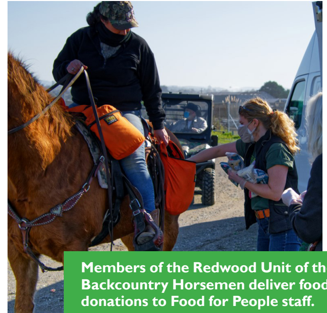
Members of the Redwood Unit of the Backcountry Horsemen deliver food donations to Food for People staff.