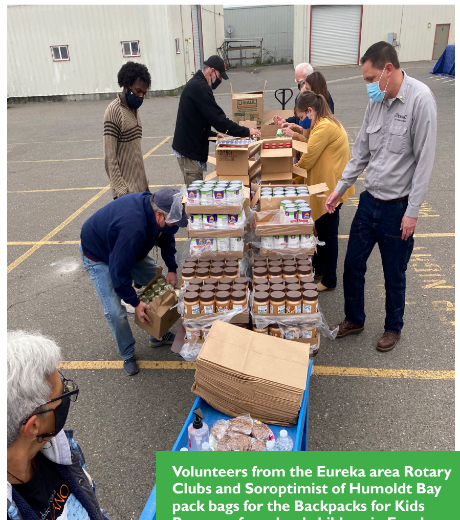
Volunteers from the Eureka area Rotary Clubs and Soroptimist of Humoldt Bay pack bags for the Backpacks for Kids Program for school children in Eureka.

We could not do this work without the support of our community and our amazing volunteers. Thank you!