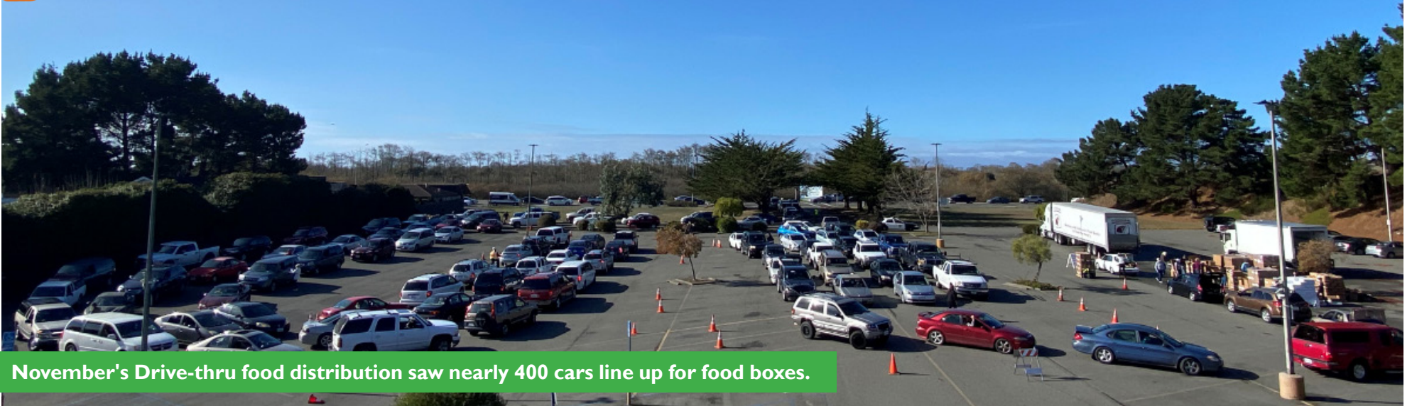
November's Drive-thru food distribution saw nearly 400 cars line up for food boxes.