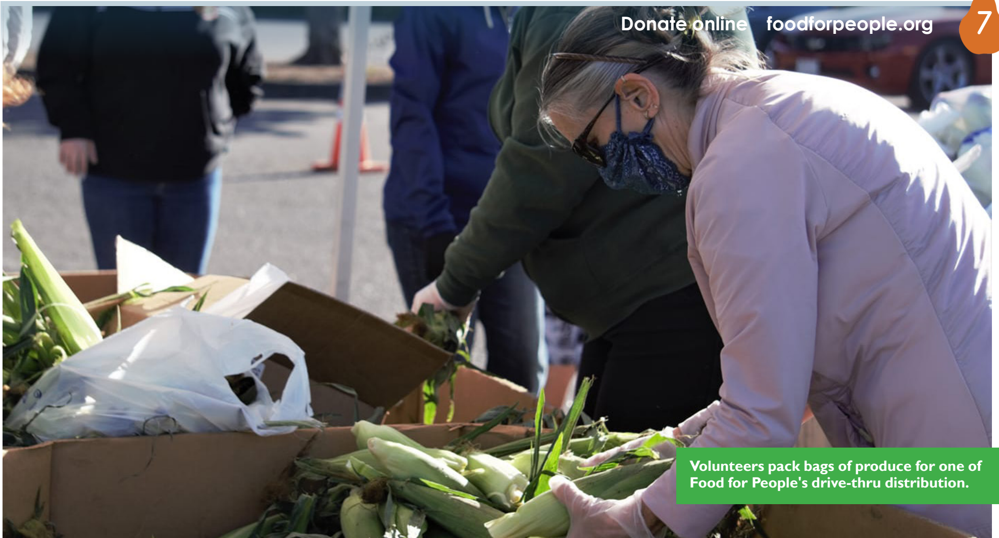
Volunteers pack bags of produce for one of Food for People's drive-thru distribution.