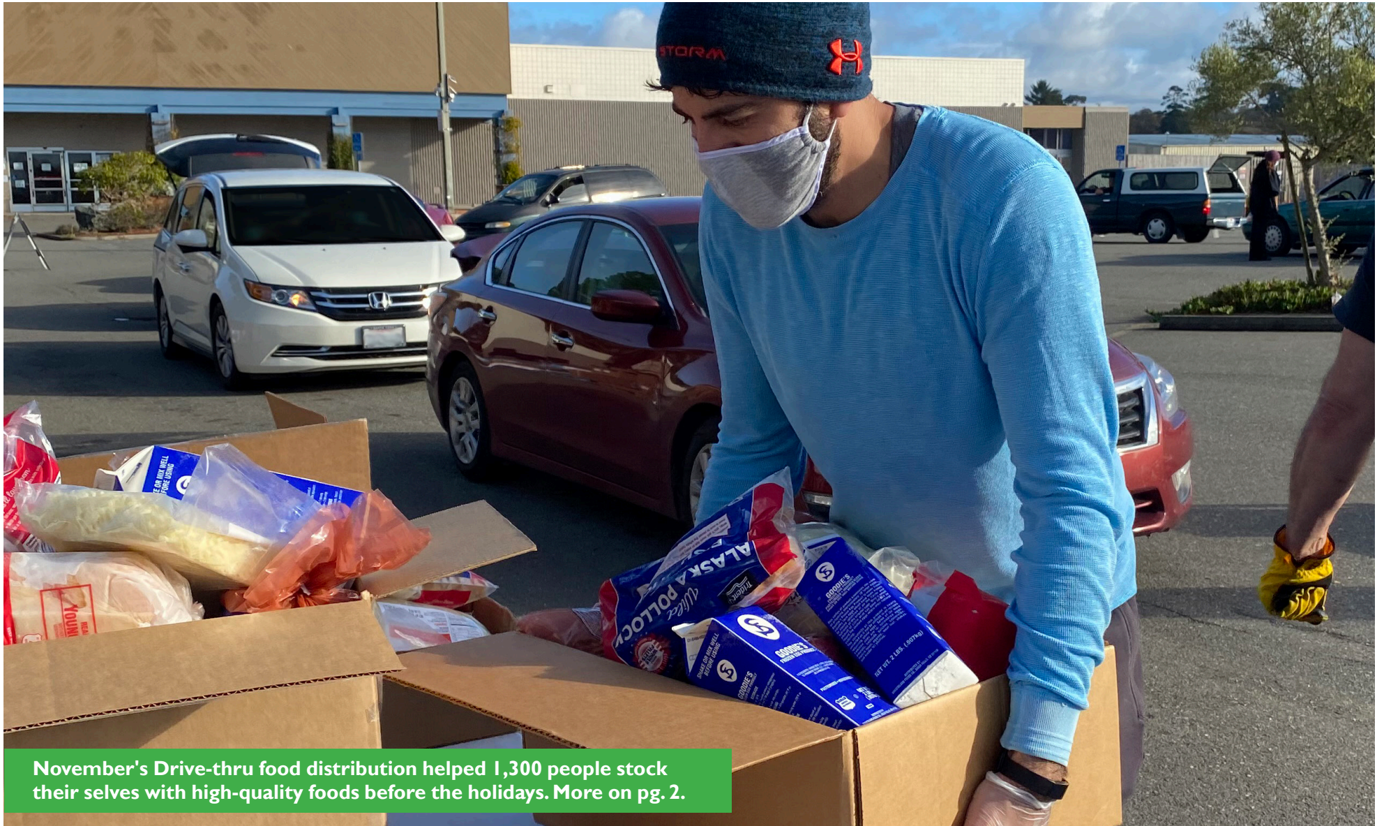
November's Drive-thru food distribution helped 1,300 people stock their selves with high-quality foods before the holidays. More on pg. 2.