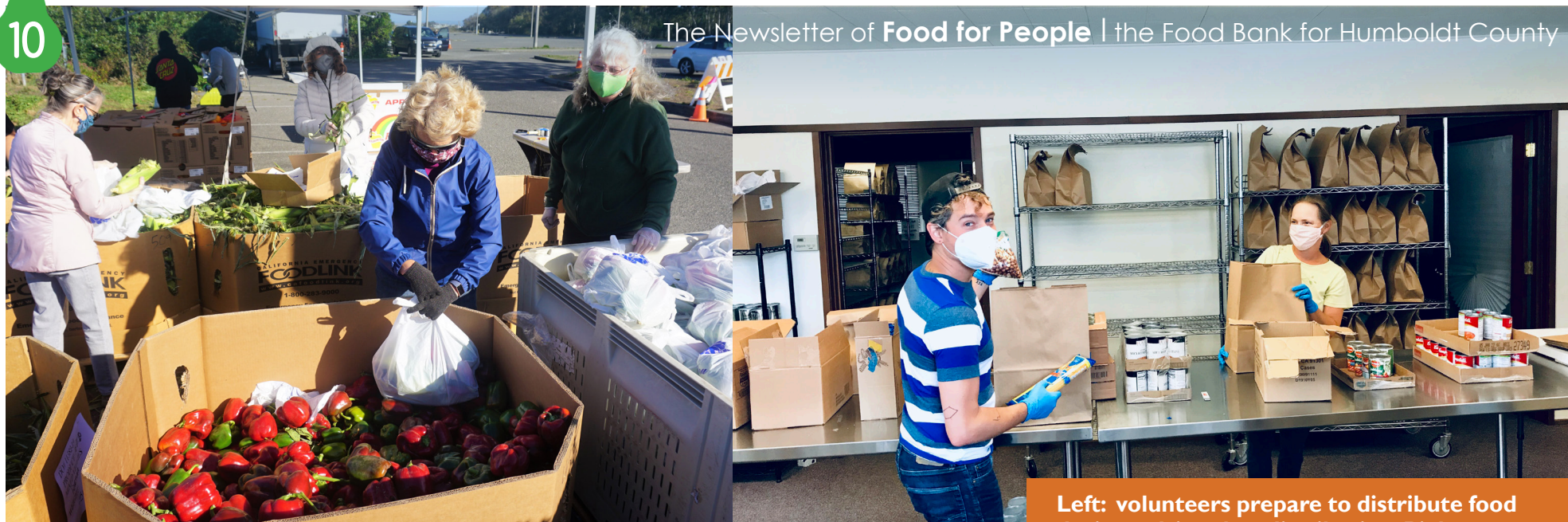
Left: volunteers prepare to distribute food during a drive-thru distribution. Right: volunteers pack food bags at our Eureka Pantry.