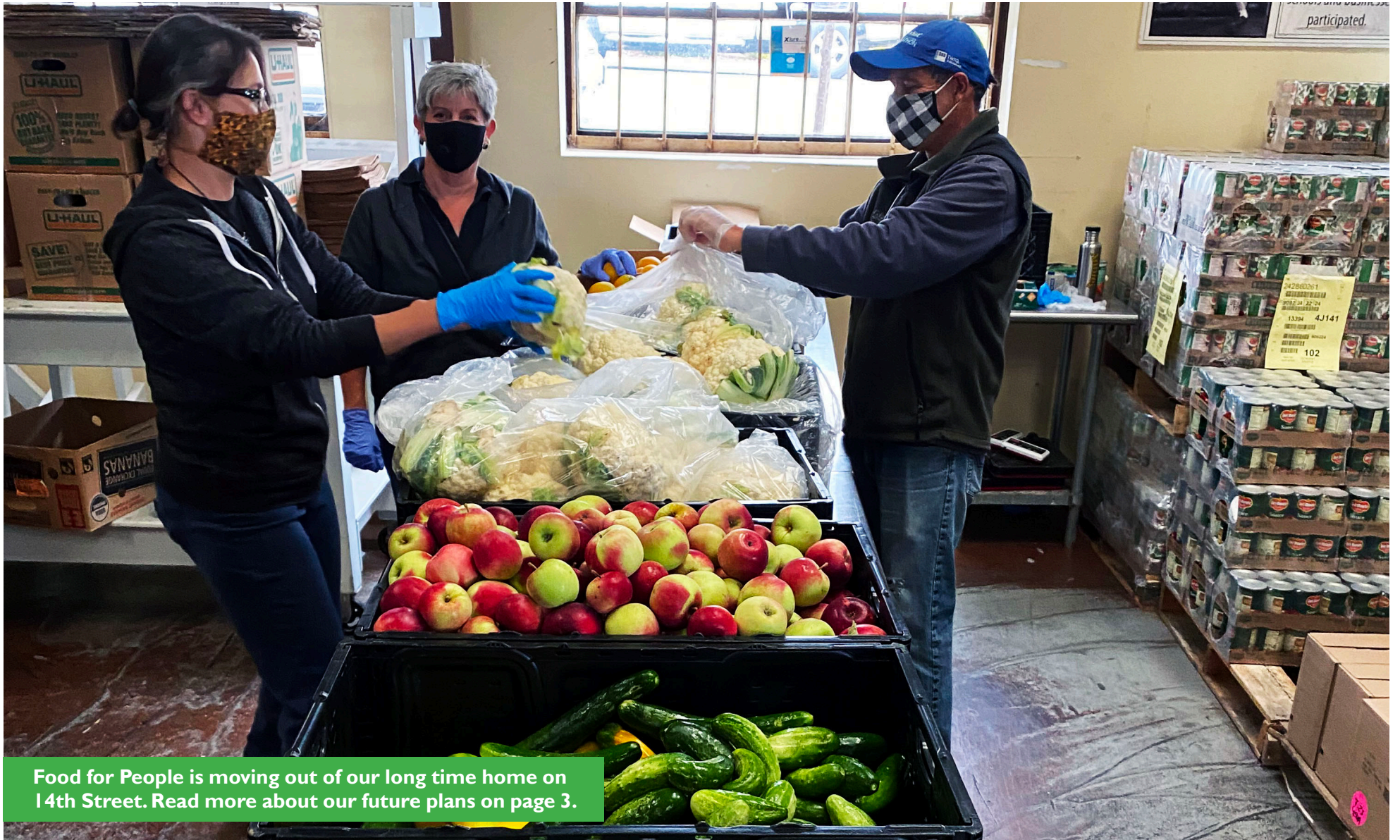
Food for People is moving out of our long time home on 14th Street. Read more about our future plans on page 3.