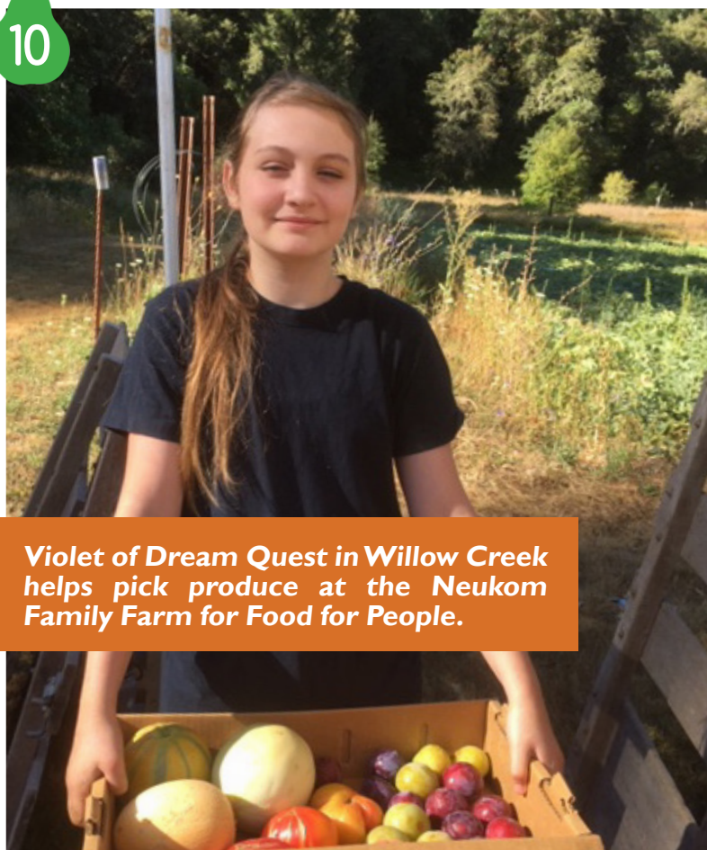
Violet of Dream Quest in Willow Creek helps pick produce at the Neukom Family Farm for Food for People.